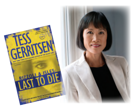
International, bestselling author, Tess Gerritsen.