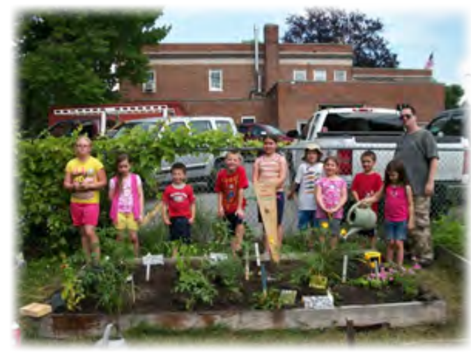
Library Community Garden

Planning was completed for the 1000 Books b4 Kinder-garten initiative scheduled for launch in January 2014. This new program will put the emphasis on early literacy.