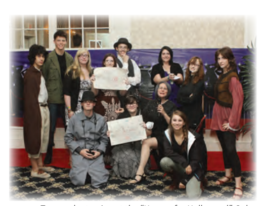
Teens volunteering at the "Hooray for Hollywood" Gala

Teens volunteered at the Library Hooray for Hollywood Gala for the second time with live roleplaying, portraying characters from <u>The Hobbit</u> and <u>The Hunger Games</u>, and welcoming guests to the Gala . The Teen Center also remained a safe place for teens of a quieter nature, with diversions such as Yu Gi Oh! and learning to knit, crochet or draw.