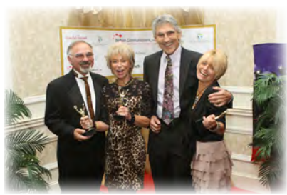
Everyone's a winner at the Gala! Guests enjoyed an evening of glamour and entertainment.