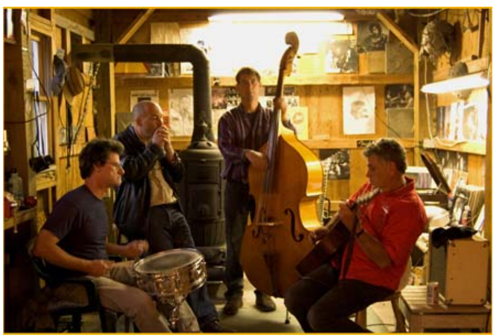
Roadside Blues Band