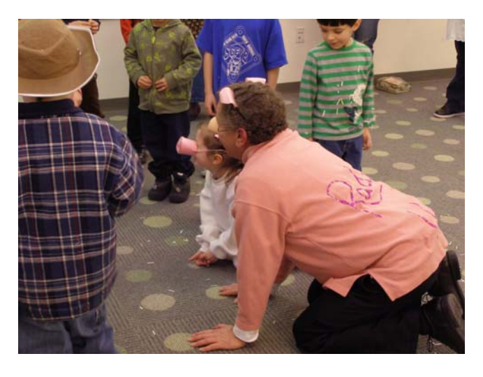
Charlotte's Web Event