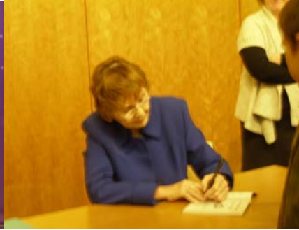
Author Patricia Reilly Giff