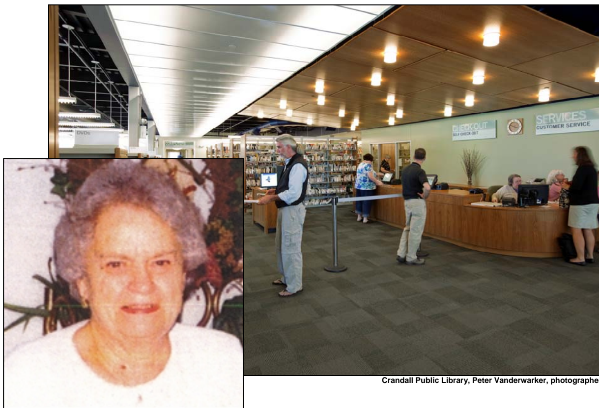
Crandall Public Library

Dedicated to our beloved friend and colleague: