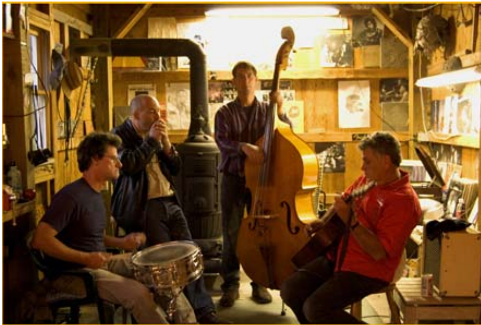
Roadside Blues Band