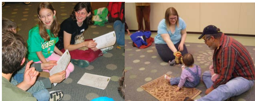
Live role playing game

We are very excited about the continued success of the Teen Center and our teens.