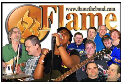
Performers: Flame The Band