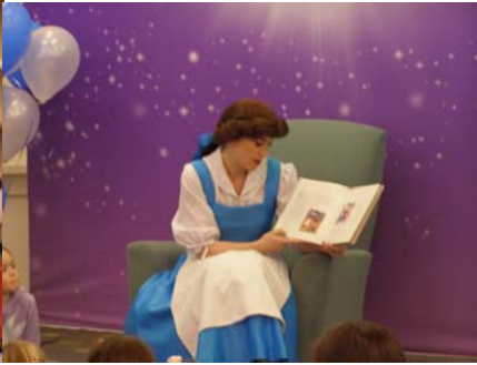
Disney's Belle reading to children