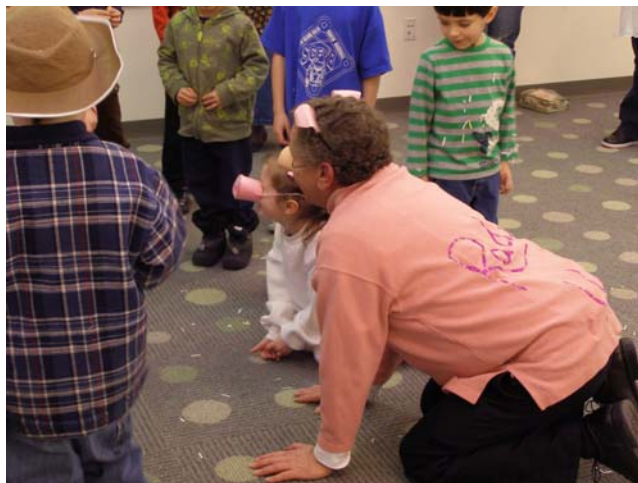
Charlotte's Web Event